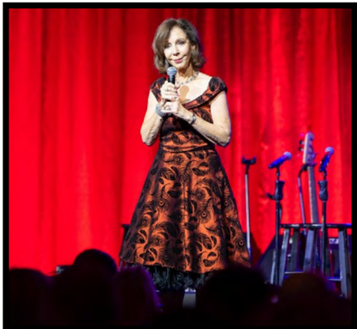
Rita Rudner kept the audience in stitches at the 32nd annual Lady in Red Gala .

We were all also singing the praises – actually, we were all laughing uproariously – when our good friend Rita Rudner took to the stage for a set of her sharpest insights and one-liners about life, marriage, getting older, trying to understand the newest technologies, and the differences between men and women. It is no wonder Rita is the biggest selling Las Vegas comedian of all time!