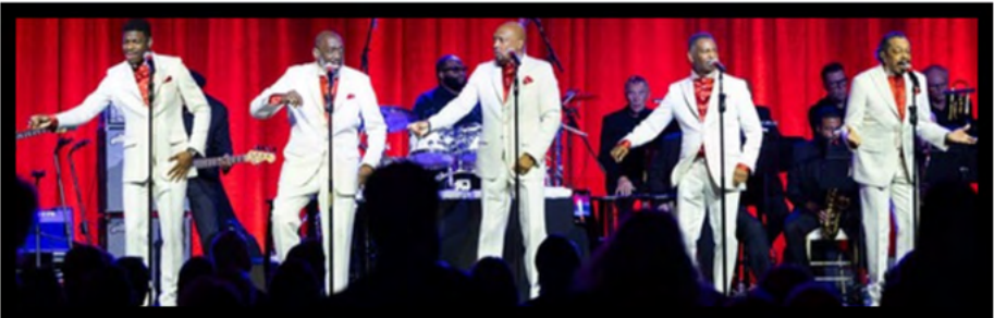
The legendary Temptations perform at The 32 nd Annual Lady in Red Gala.

Beyond the Mardi Gras motif, though, the reasons the gala was such a rousing success are manifold, starting with fabulous cocktail hour, which once again featured the always wonderful Palm Beach Symphony performing memorable songs from the greatest, most beloved Broadway shows – from "Phantom of the Opera" to "Oklahoma," among so many others. I know that as I walked around the room greeting and thanking you all for coming, I noticed quite a few of you humming and singing the words to the iconic melodies from those hits.