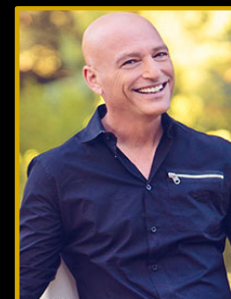
Entertainment by the hilarious stand-up comedian Howie Mandel

For information or to request an invitation please call 561.582.8083 or email life@life-edu.org .