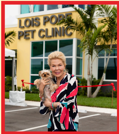
The Lois Pope Pet Clinic at Tri-County Animal Rescue offers low-cost and often free health and medical care for pets from low-income underserved families.

We all know the saying that July and August represent the “dog days” of summer. But I’m betting that very few of us – myself included – actually know why. Thank goodness for that wonderful little computer search engine called Google; a quick search revealed that when the constellation Sirius, the Dog Star, would appear in the sky just before the sun, near the end of July, it marked the beginning of the hottest days of the year. The Romans referred to this period as “dies caniculares” or “days of the dog star.” This was eventually shortened to just “dog days.”