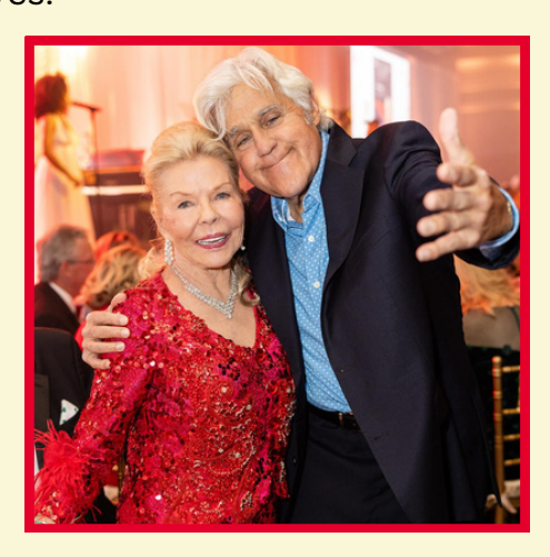
Lois Pope and Jay Leno

That is wonderfully manifested in our philanthropic support from the gala. We raised $2 million to benefit two very necessary initiatives: