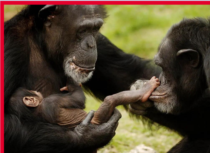
A chimpanzee family at the zoo in Tulsa, Okla.