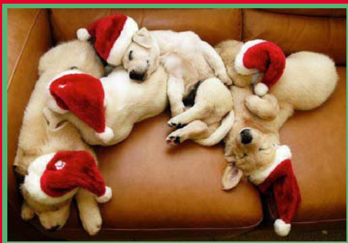
Santa's little helpers . . .